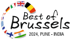
BEST OF BRUSSELS